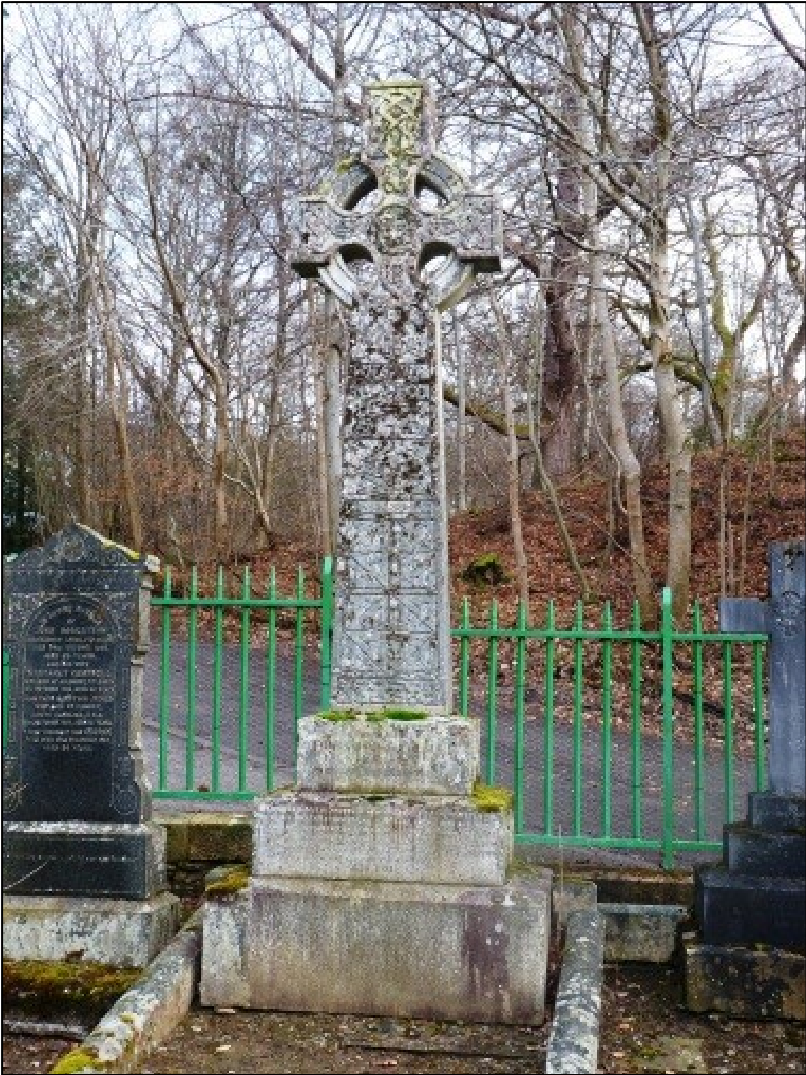
Memorial cross for RW Irvine in Pitlochry cemetery, raised by public subscription after his death.