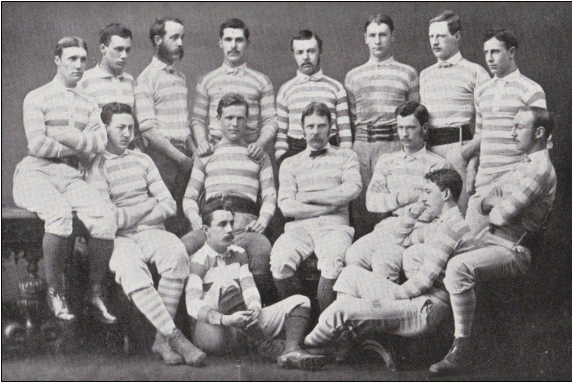
Edinburgh Academicals 1878, including nine Scotland internationals*.