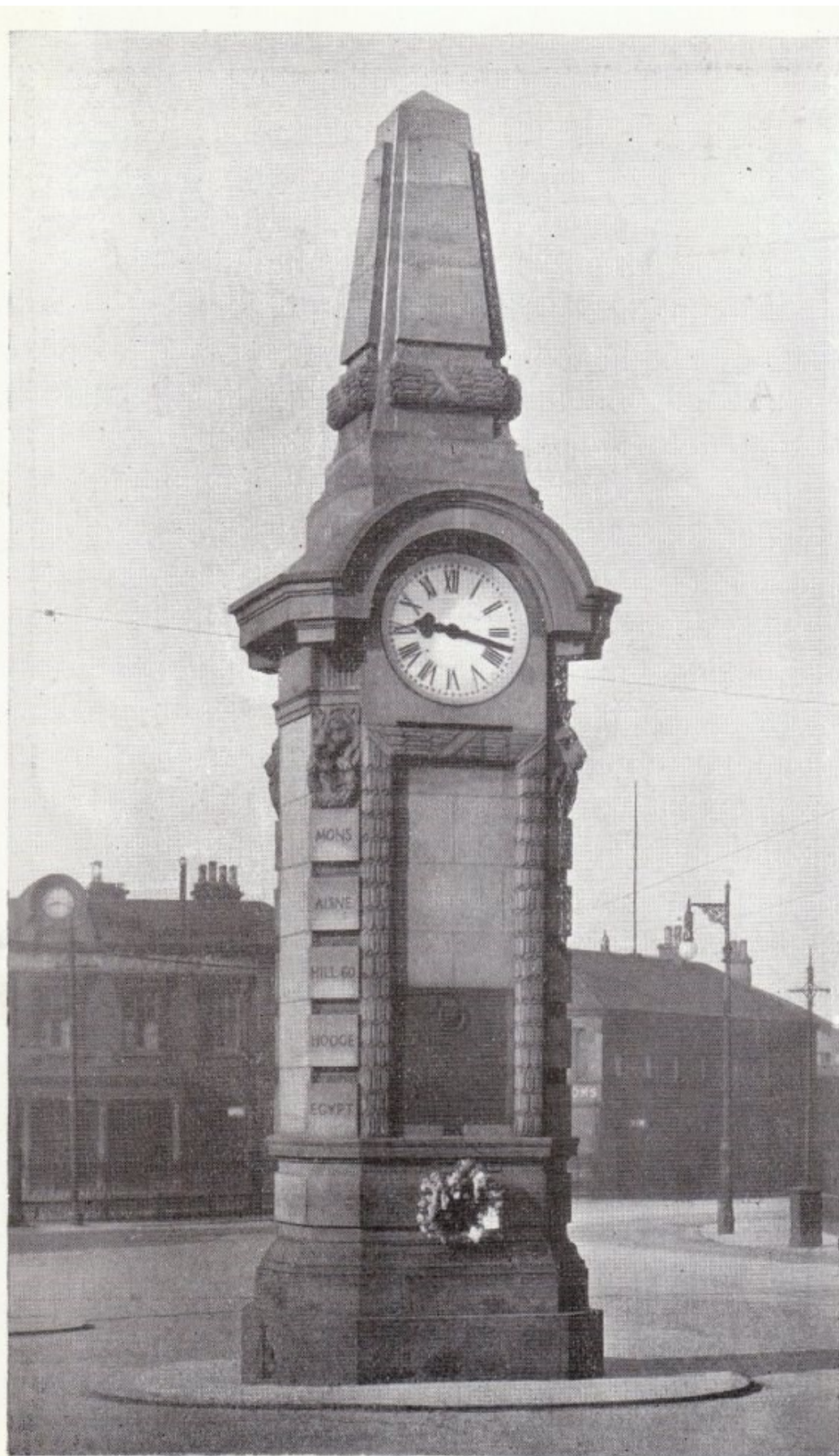
HEART OF MIDLOTHIAN F.C. WAR MEMORIAL AT HAYMARKET.