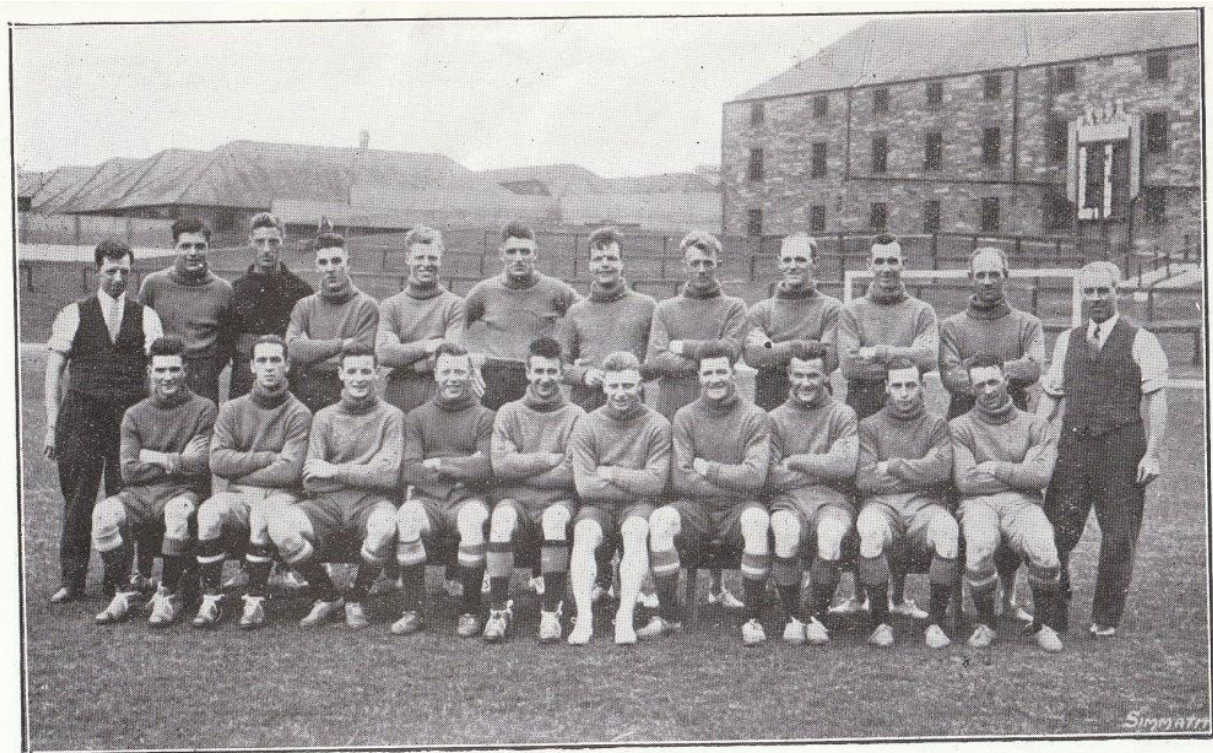
TEAM, SEASON 1928-29.